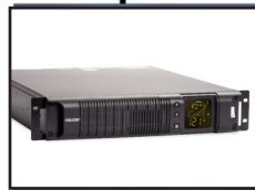
SVR Series Precision Voltage Regulator regenerates totally new AC power for your critical equipment